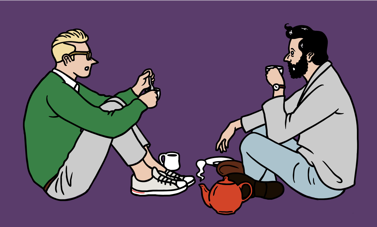
Get in touch for an initial chat.